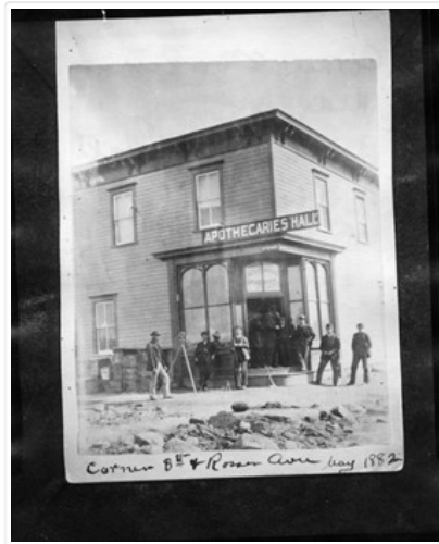
Cornell Bldg & Room across way 1882