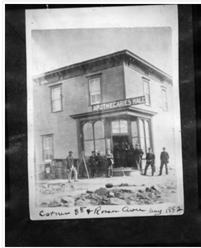
Cornell B 5 & Rossan Corner May 1882