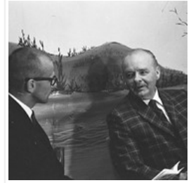
Promotions department (personalities & programs) - Don Messer ...