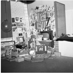
Anniversary card contest