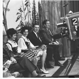
Promotions department (personalities & programs) - Don Messer ...