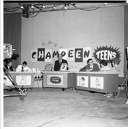
Promotions department (personalities & programs) - Champeen Teens