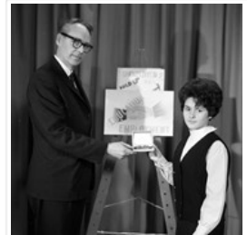
Personalities of Topic 65