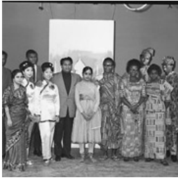
Professor's Parlour (national costumes)