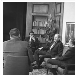
Professor's Parlour (Eugene Forsey interview)