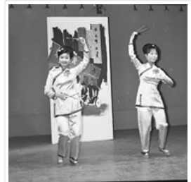
Professor's Parlour (national costumes)