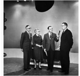
Co-Op grand prize winner (Raceways wind-up)