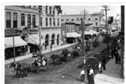
Horse and carriages travelling on Rosser Avenue http://archives.brandonu.ca/en/permalink/descriptions13702

Part Of: Fred McGuinness collection Description Level: Item Series Number: McG 9