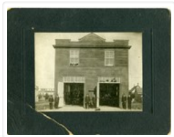
Brandon Fire Station No.2 with wooden exterior http://archives.brandonu.ca/en/permalink/descriptions13995

Part Of: Fred McGuinness collection Creator: Photography: J.W. Wilson Co., 143 Queen W., Toronto Description Level: Item Series Number: McG 9 Item Number: 1-2015.65 Accession Number: 1-2015 GMD: graphic Date Range: [1913] Physical Description: 7" x 5" (b/w) Material Details: on matting Physical Condition: Matting is bent