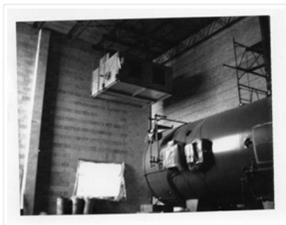
View from the roof of the old steam plant