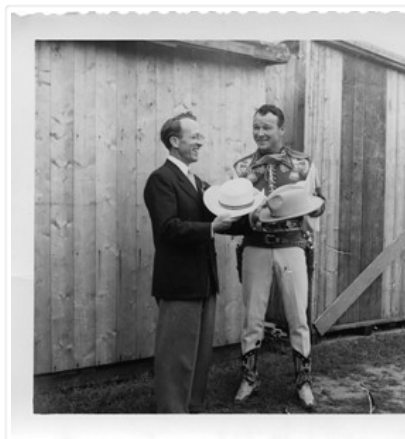
Roy Rogers with Tommy Douglas