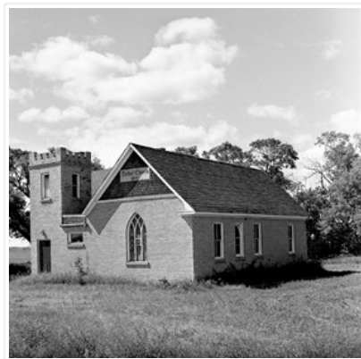
Bethel Church (1895) on Highways 2 & 21 west of Deleau, Manitoba.