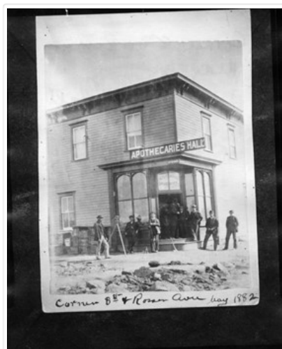
Corner B & Ross Ave May 1882