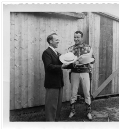
Roy Rogers with Tommy Douglas