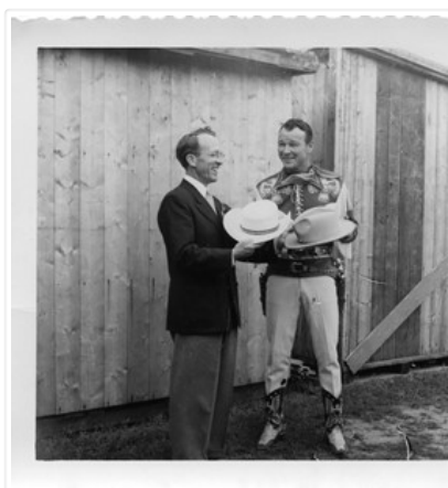
Roy Rogers with Tommy Douglas