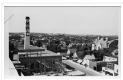
Aerial view of 10th Street facing south from Princess Avenue http://archives.brandonu.ca/en/permalink/descriptions8420

Part Of: Joseph H. Hughes collection Creator: Photographer: Jerrett Photo Description Level: Item Series Number: 3-1997.1