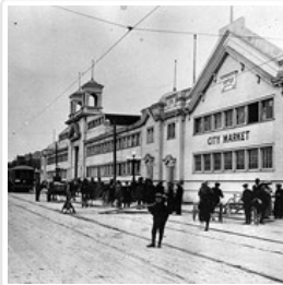
Winter Fair Buildings and Streetcars