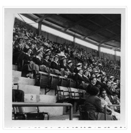
Saskatchewan Jubilee Choir at baseball diamond http://archives.brandonu.ca/en/permalink/descriptions14092