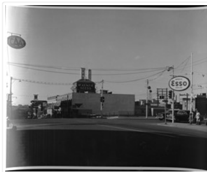
Northeast corner 10th Street and Princess Avenue, Brandon,