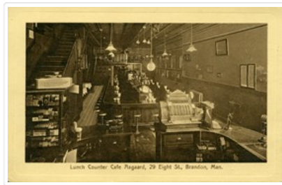
Lunch Counter Cafe, Brandon, 29 Eight St., Brandon, Man.