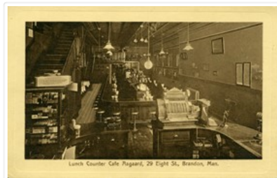
Lunch Counter Cafe Aagaard, 29 Eighth St., Brandon, Man.