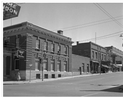
10th Street Businesses - East Side of 100 Block