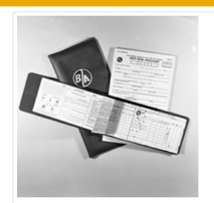
British American dealers - credit books