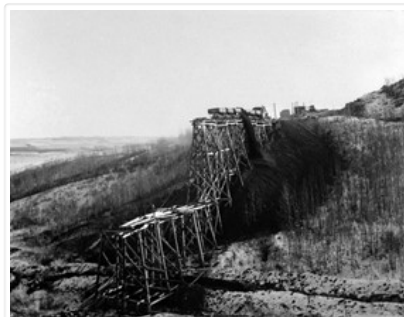
Great Northern (BS&HB) Railway overpass east of Bunclody