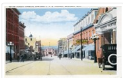
Tenth Street looking towards CPR Station, Brandon, Man. http://archives.brandonu.ca/en/permalink/descriptions13780

Part Of: Fred McGuinness collection Description Level: Item Series Number: McG 9