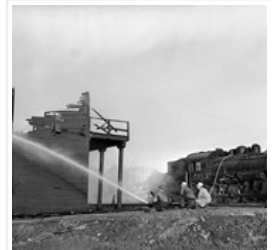
CPR Ice House Fire