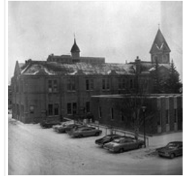
Original Brandon City Hall