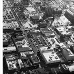
Aerial View of Core Area