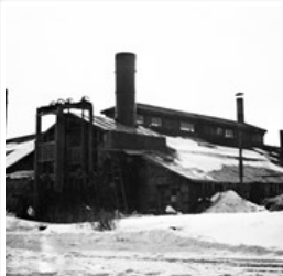
Brandon Machine Works