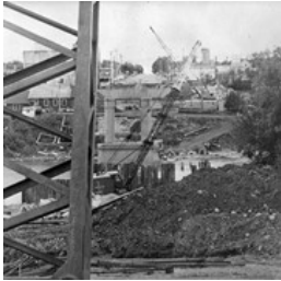
Demolition of Second First Street Bridge