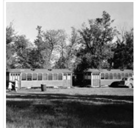
Streetcar Bodies in Tourist Park