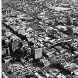
Aerial View of Core Area