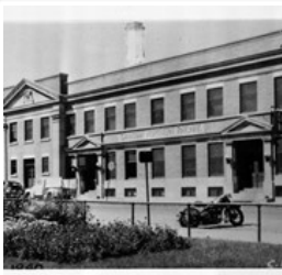
Prince Edward Hotel - Railway Station