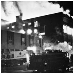
Security Building Fire