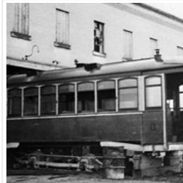
Dismantling of Streetcar No. 8