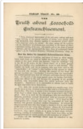
The truth about leasehold enfranchisement