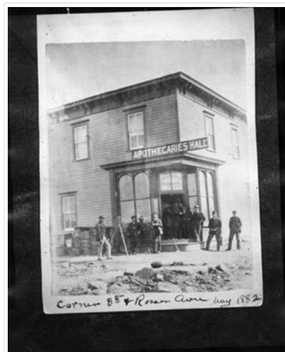
Corner B & Ross Ave May 1882