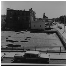
Northeast corner 10th Street and Princess Avenue, Brandon, ...