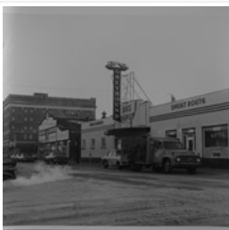
Greyhound Bus Depot, 11th Street and Princess Avenue, ...