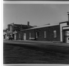
West side 200-block 10th Street facing south from ...