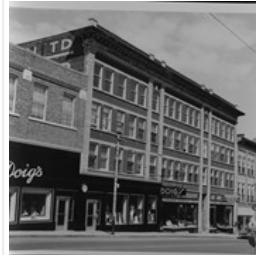
West side of 10th Street facing north from ...