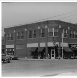
Hughes Building, corner of 10th Street and Princess ...