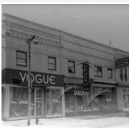
Rosser Avenue between 7th and 8th Streets, south ...