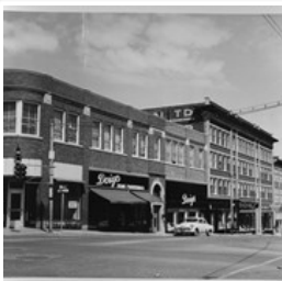
West side of 10th Street from Princess Avenue, ...