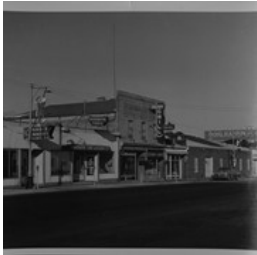
West side 200-block 10th Street, south of Princess ...