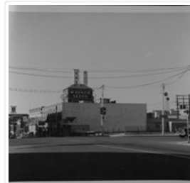
Northeast corner 10th Street and Princess Avenue, Brandon, ...