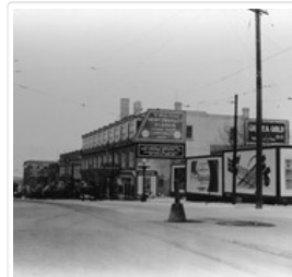
Intersection 10th Street and Princess Avenue, Brandon, Manitoba