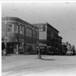
Corner of 10th Street and Princess Avenue, Brandon, ...