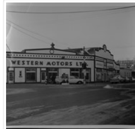
Western Motors at southwest corner 10th and Princess ...