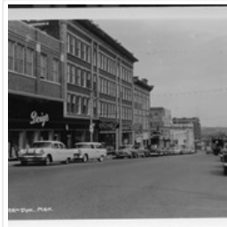
10th Street from Princess Avenue facing north, Brandon, ...