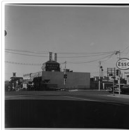
Northeast corner 10th Street and Princess Avenue, Brandon, ...