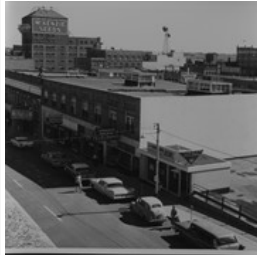
East side 10th Street facing north from Princess ...