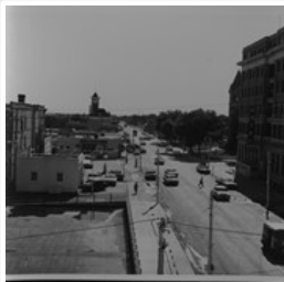
Princess Avenue facing east from 10th Street, Brandon, ...