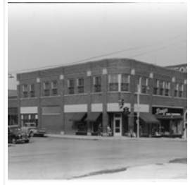
Corner of 10th Street and Princess, Brandon, Manitoba