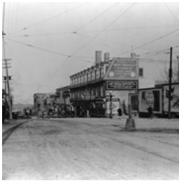
Intersection 10th Street and Princess Avenue, Brandon, Manitoba