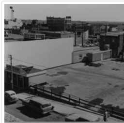
Northeast corner 10th Street and Princess Avenue, Brandon, ...