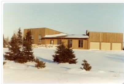
Christmas Tree Farm - house, overview