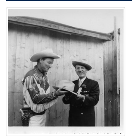
Early railroad day in wpg Havey on left alive on night