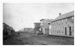
Queen's Hotel on the corner of 10th Street and Rosser Avenue http://archives.brandonu.ca/en/permalink/descriptions13778

Part Of: Fred McGuinness collection Description Level: Item Series Number: McG 9 Item Number: 20-2009.89 Accession Number: 20-2009 GMD: graphic Date Range: 1883 Physical Description: 7.25" x 4.25" (b/w) Material Details: on matting Physical Condition: Left hand corner of mat is bent. Mock-up instructions are written in pencil at the bottom right hand corner. Portions of the photograph itself are marked with pen.