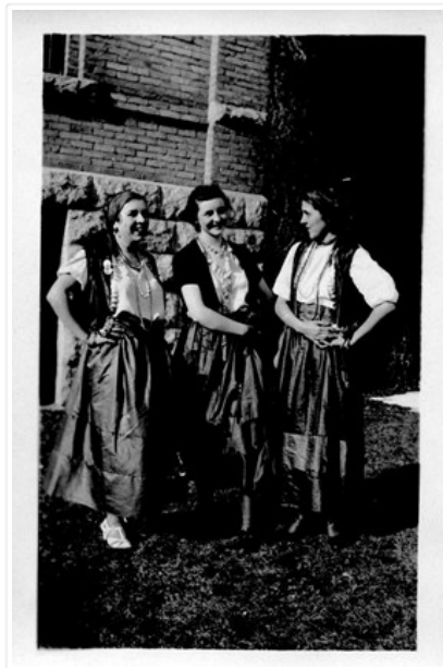
Class of 1933 girls in costume for the literary shield