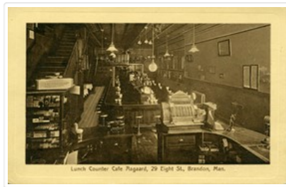
Lunch Counter Cafe Restaurant, 29 Eight St., Brandon, Man.