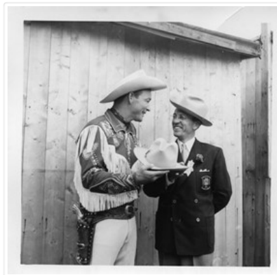
Roy Rogers with Tommy Douglas