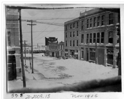
Street scene 8th Street in winter