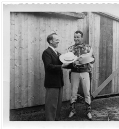
Roy Rogers with Tommy Douglas