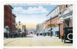
Tenth Street looking towards CPR Station, Brandon, Man.

http://archives.brandonu.ca/en/permalink/descriptions13780