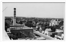
Aerial view of 10th Street facing south from Princess Avenue http://archives.brandonu.ca/en/permalink/descriptions8420

Part Of: Joseph H. Hughes collection Creator: Photographer: Jerrett Photo Description Level: Item Series Number: 3-1997.1 Item Number: 3-1997.1.42 Accession Number: 3-1997 GMD: graphic Date Range: c.1940 Physical Description: 5.5" x 3.5" (b/w) Material Details: postcard Physical Condition: Red ink stain is on the front right corner of postcard