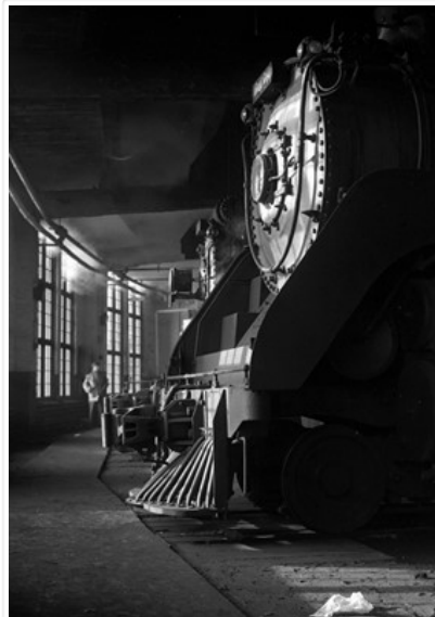
CPR Roundhouse Interior