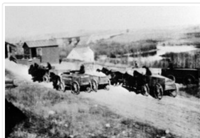
Great Northern freight shed, Brandon