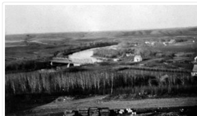
Farm Wagons at Great Northern (BS&HB) Station in Bunclody