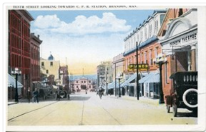
Brandon street cars in front of Winter Fair Building on 10th Street