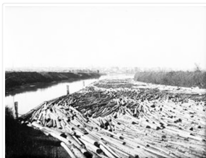
Logs Destined for Hanbury Manufacturing Co. - looking north from 3rd Street