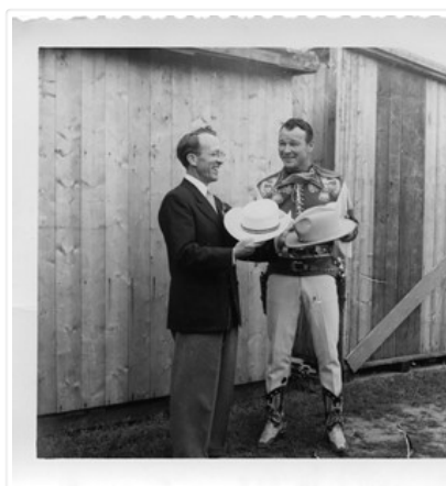
Roy Rogers with Tommy Douglas