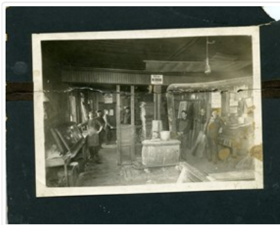
Brandon Fire Station No.2 with wooden exterior