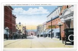
Tenth Street looking towards CPR Station, Brandon, Man. http://archives.brandonu.ca/en/permalink/descriptions13780

Part Of: Fred McGuinness collection Description Level: Item Series Number: McG 9 Item Number: 20-2009.91