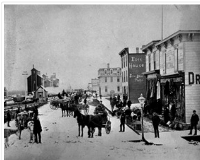
Street scene 8th Street in winter