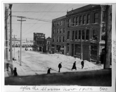
Residential street in December 1906

http://archives.brandonu.ca/en/permalink/descriptions13708