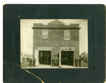
Brandon Fire Station No.2 interior