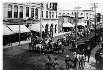
Horse and buggies travelling east on Rosser Avenue