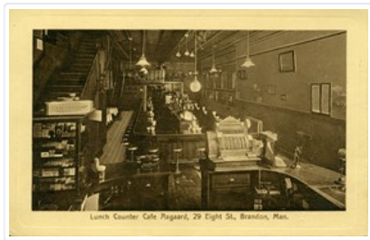
Lunch Counter Cafe Regard, 29 Eight St., Brandon, Man.