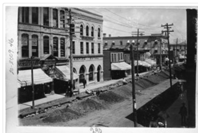
Early scene of Rosser Avenue facing west