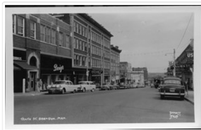
Northeast corner 10th Street and Princess Avenue, Brandon, Manitoba