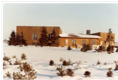
Christmas Tree Farm - back of house